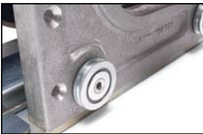
Precision, maintenance-free carriage bearings