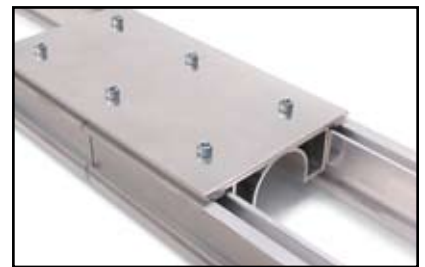
Track connector plate